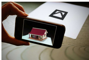
Augmented reality.