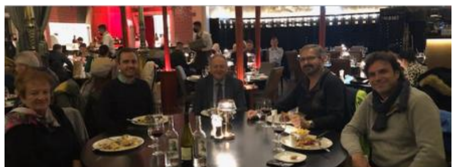
Dublin, Ireland, December 2021.