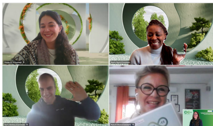
Project partners during the 2nd transnational online meeting, 16th November 2023

The Project has entered month 11 and the partners met to plan the two main important project outputs, apart from the laptops donation. The meeting was about the preparation of the modules of the two training courses that will be delivered to the beneficiaries of the project.